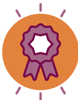
Recognising Success Awards