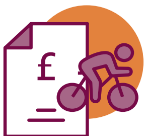
Cycle Salary Sacrifice