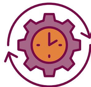
Flexible Working Options