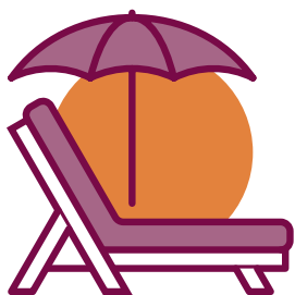
Generous Pension Scheme & Annual Leave Entitlement

University Hospitals Bristol and Weston NHS Foundation Trust is delighted to offer you a wide range of flexible staff benefits. We've included a snapshot below!